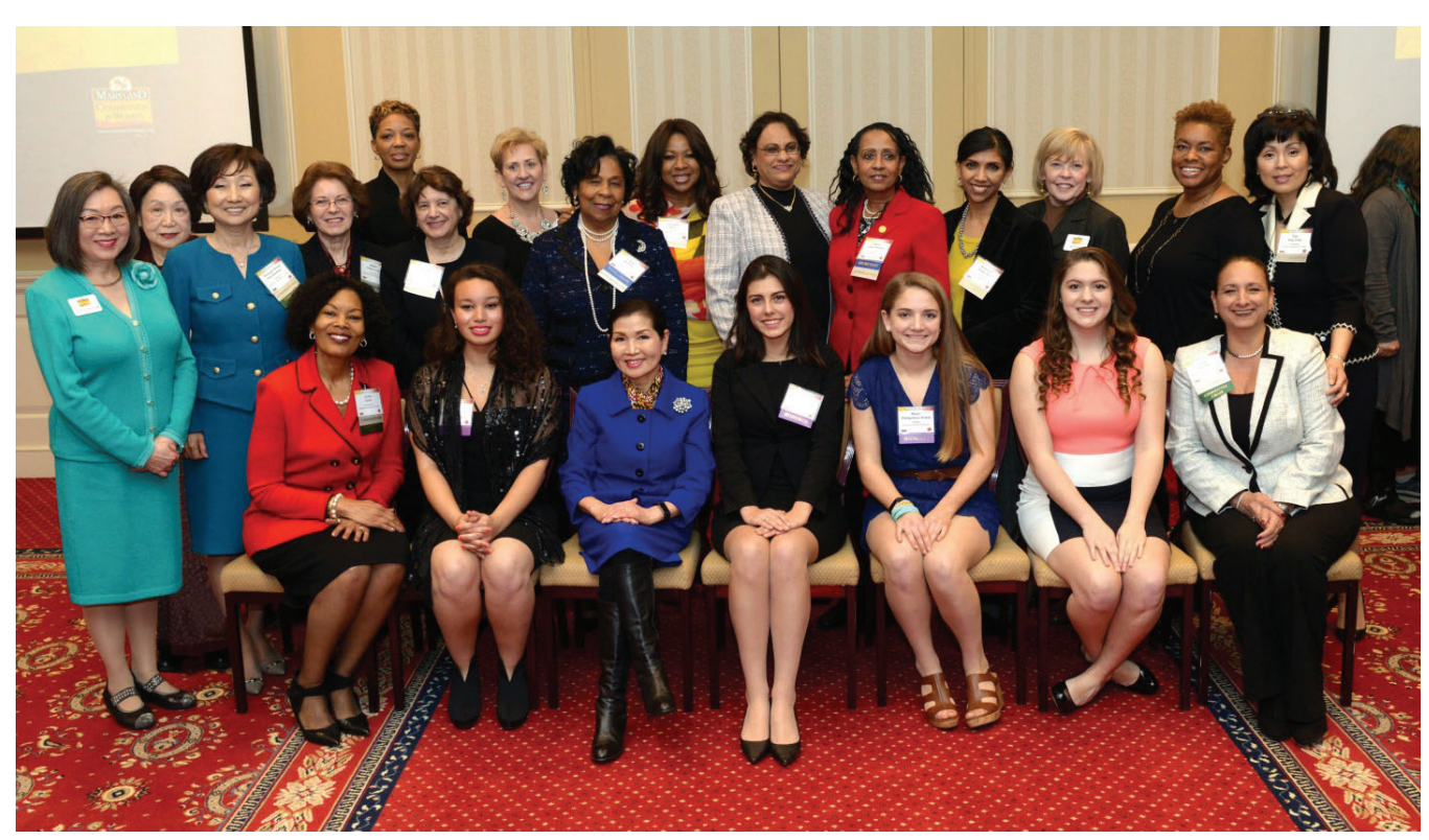
2017 Maryland Women of Tomorrow with members of the Commission for Women and First Lady Yumi Hogan (center).